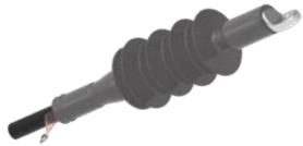
COLD SHRINK TERMINATIONS UP TO 52 kV

Our Raychem heat shrink, cold shrink and dry type terminations handle long-term electrical stress. Easy to install with high-reliability thanks to our material science.