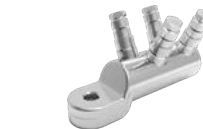
SHEAR BOLT LUGS FOR ALUMINUM FLEXIBLE CABLES