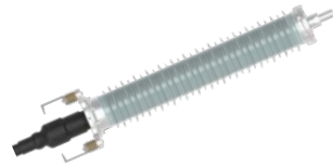
DRY TYPE TERMINATIONS UP TO 170 kV