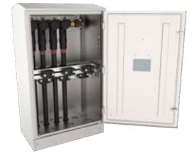
JUNCTION BOXES UP TO 36 kV