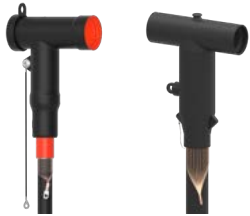
SEPARABLE CONNECTORS UP TO 42 kV

Our Raychem inner and outer cone separable connectors are easy to install, compact and adaptable to most cable types to reduce your installation time and costs.