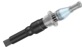
PLUG-IN TERMINATIONS UP TO 245 kV