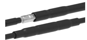
INSULATING JOINT COVERS